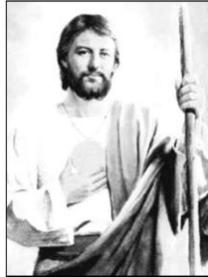
St James, Pray for us! Protomartyr of the Apostles, Pray for us!